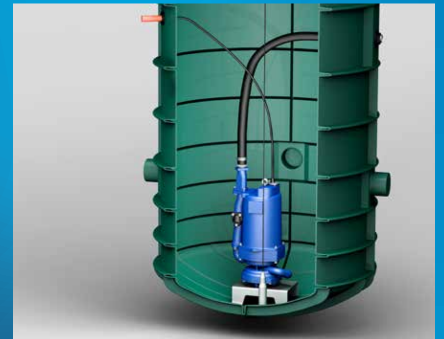
PRESSURE SEWER SYSTEMS