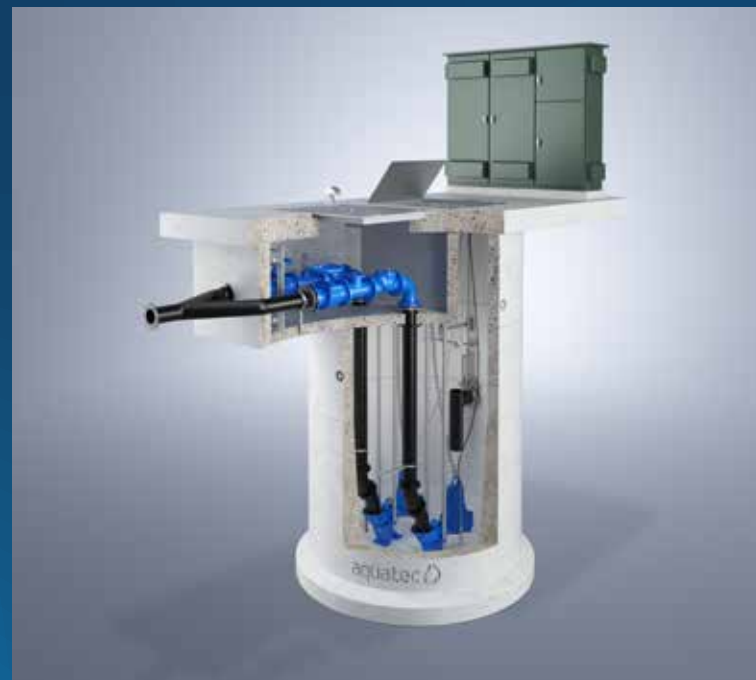
CONCRETE PUMP STATIONS