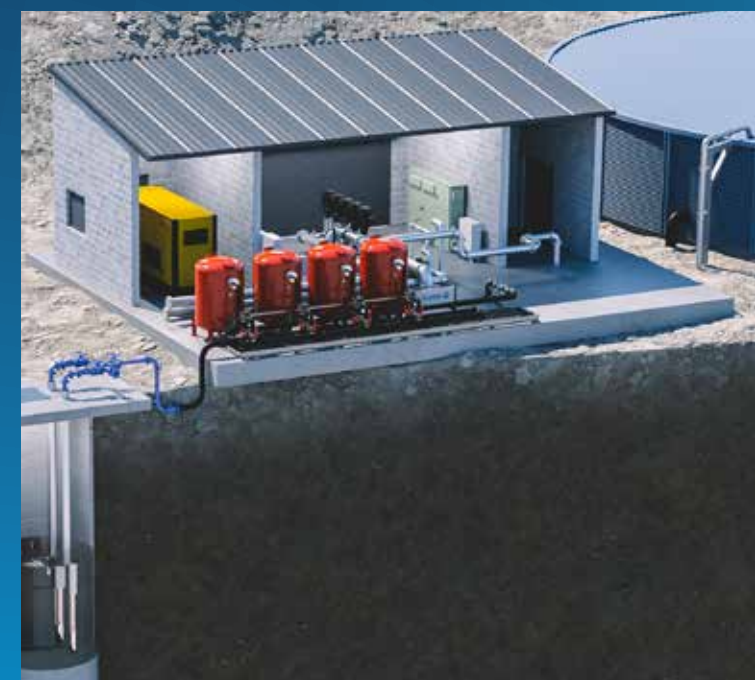
WATER AND WASTEWATER REUSE