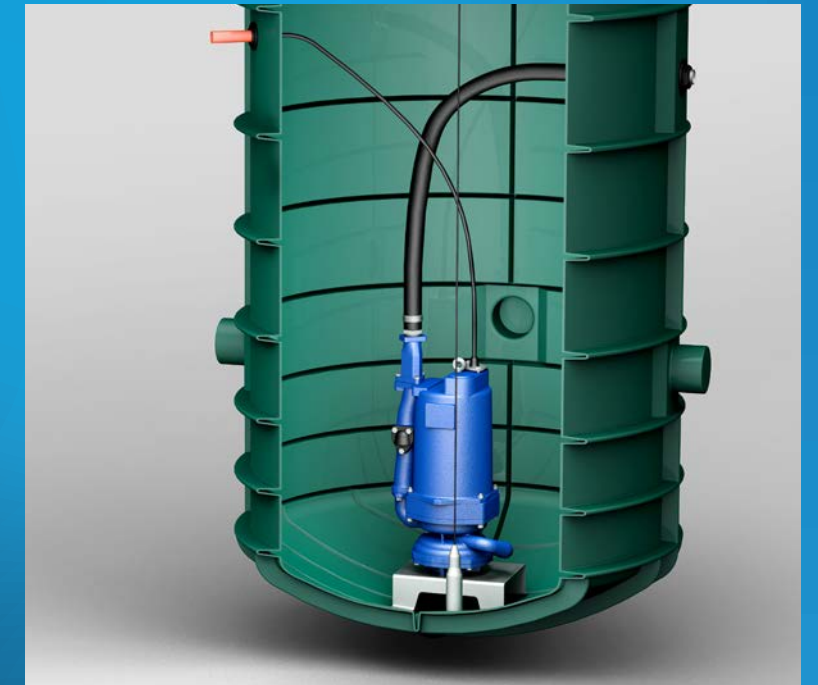
PRESSURE SEWER SYSTEMS