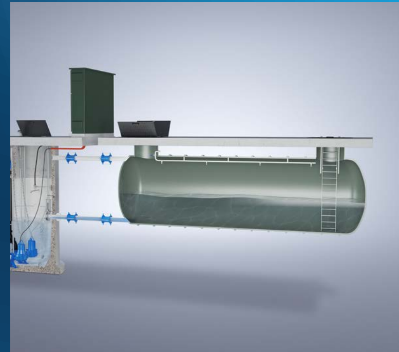
FIBREGLASS STORAGE VESSELS