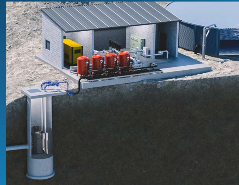
WATER AND WASTEWATER REUSE