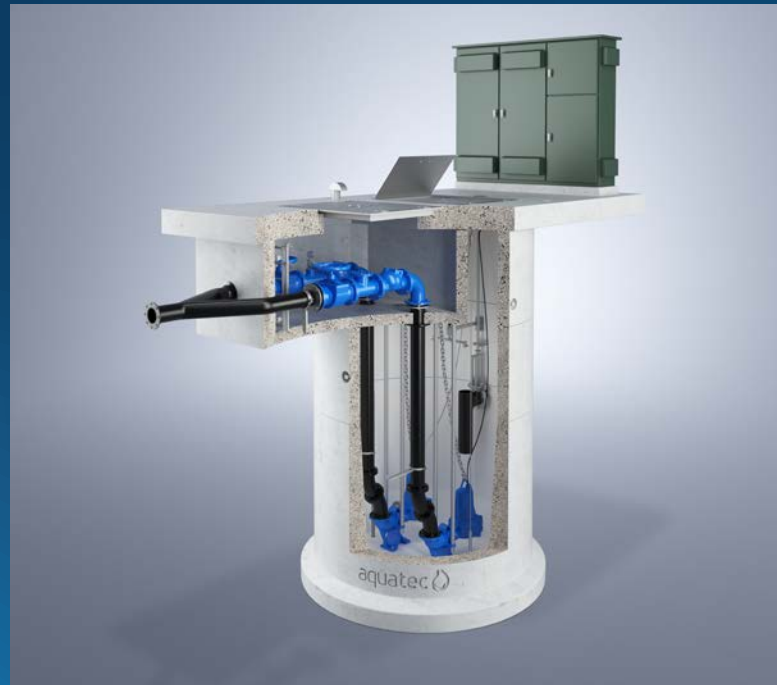
CONCRETE PUMP STATIONS