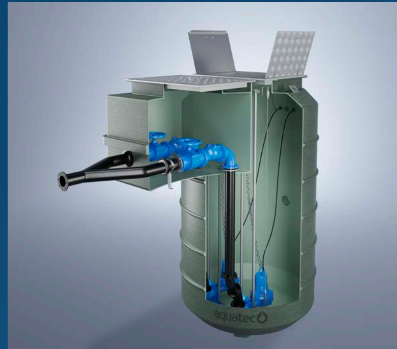
FIBREGLASS PUMP STATIONS